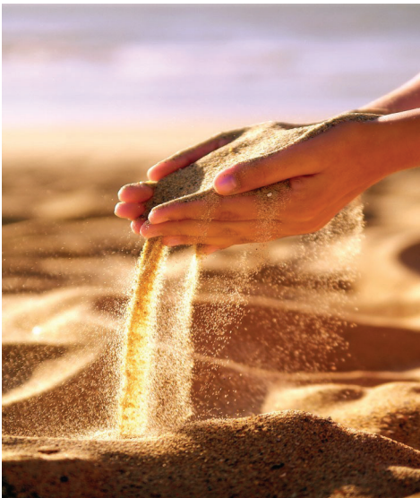
Dust to dust: We are made of the dust of the earth and our days pass like sand in an hourglass. Human life is so transient. And after our time runs out — what next? Is this brief interlude on earth all there is?

death. Since scientists don't have the tools to observe or determine the answer, it is interesting to see what God says about it. His take on the "afterlife" is outlined in the Bible.