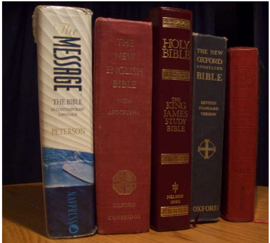
Modern translations of the Bible that owe their existence to the King James version (centre): The Message, The New English Bible, The Revised Standard Version, and The New International Version.

In 1603, on the death of Elizabeth I, James VI of Scotland ascended the throne of England as James I, and became the first monarch to unite Scotland, England, and Ireland as Great Britain. He was also the founding monarch of the American colonies, giving his name to Jamestown, Virginia. He was a talented scholar and wrote several books and articles on poetry, law, politics, and religion. He became patron for one of his most famous subjects, William